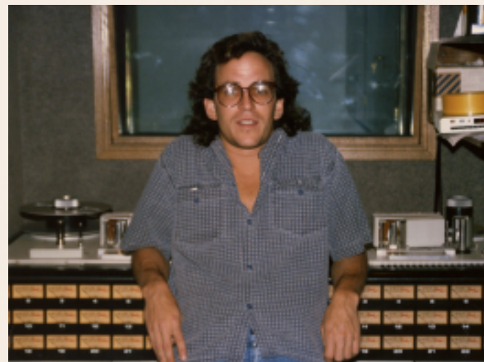
Steve Porcaro, 1986.

The melody for this has yet to find a home in an album or film but many friends and family remember when it won the Roland Contest the second year. For myself it was the start of working through a more unified sense of form as well as finally having more recording tracks to work with. Up to 8 of them. Wow.