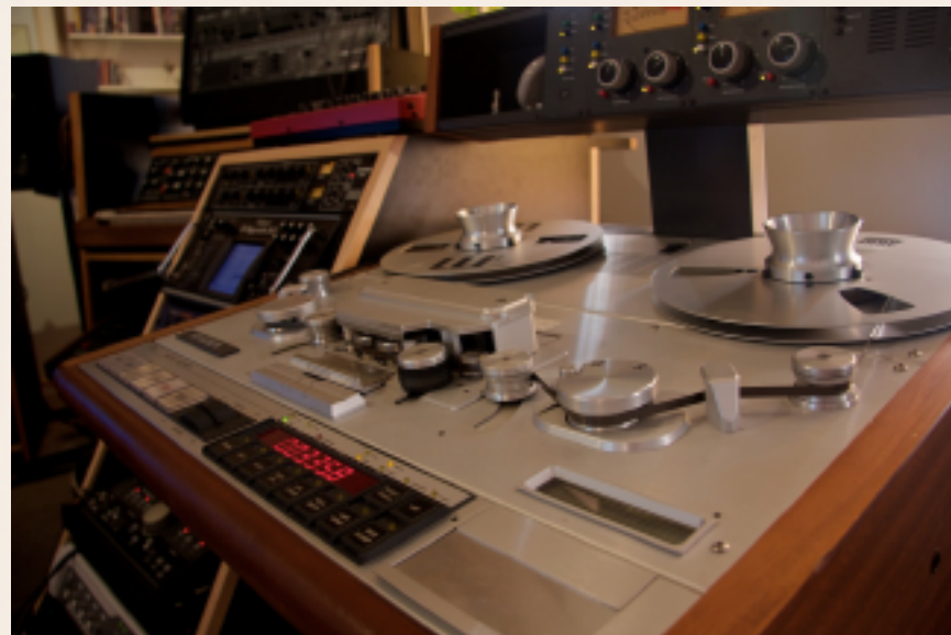
My enduring love of tape.

In retrospect I wonder if we should have put this piece (along with Track 01 “March of Progress”) into Virtuality, but unless we do a surround mix this compilation may be its only home.