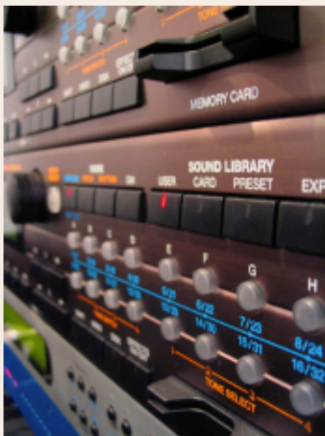
Studio circa 2004

Using vintage and virtual synthesizers that were in my studio (circa 2004) I ventured to re-create Ravel's lively fandango along with an underwater seascape interlude.