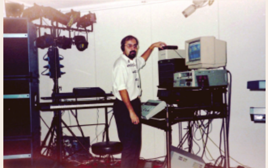
Roland demonstration on stage, Frankfurt, Germany, 1991.

My years doing Roland demos were very enjoyable because to me each machine was a brand new orchestra. The joy came from the challenge of writing performing and mixing with a fixed palette of sounds, the same way one works with a live orchestral ensemble.