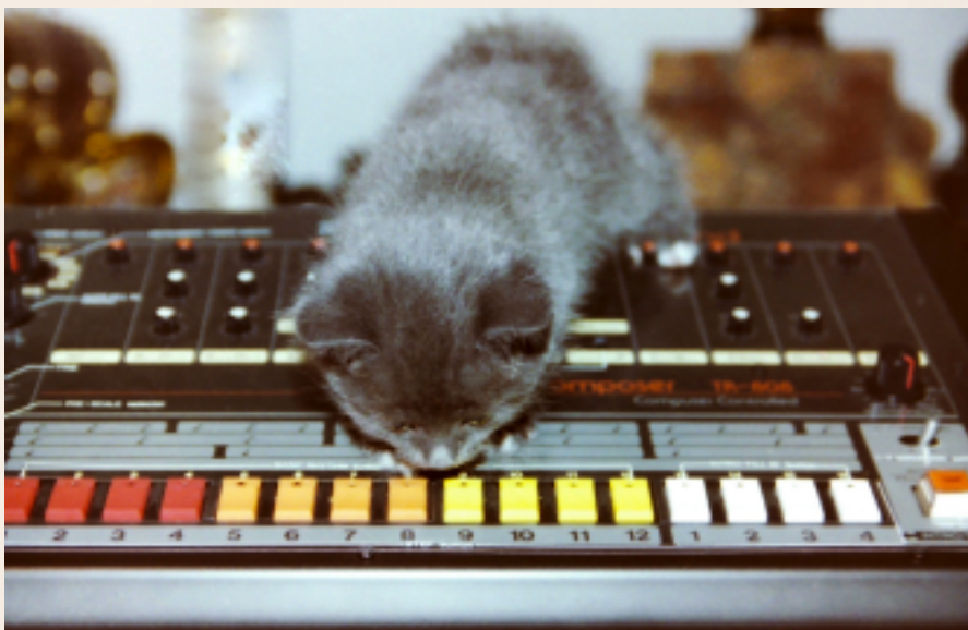
Capturing the mews. (Ugh, sorry.)

Haru-Ni was going to be used in Interstellar Suite but felt out of place once the other movements were finished. It is a friends and family favourite though and was used in the Vancouver planetarium presentation of Interstellar Suite in 1988.