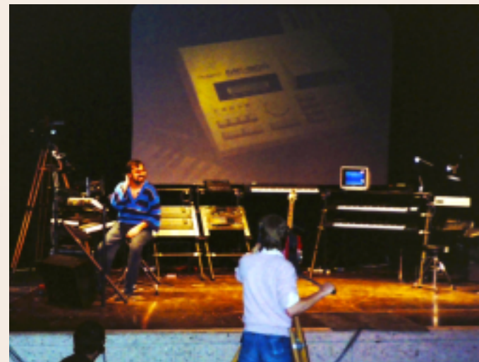
At a Roland presentation, 1987.

There’s a nod to electronic innovator Jean-Jacques Perry in the humour and rapid panning of sounds in this piece.