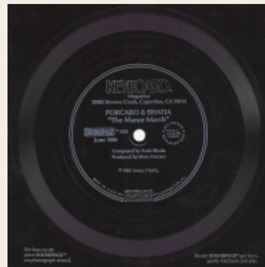
Keyboard Magazine Soundpage, 1986

I am forever grateful to Steve Porcaro, David Paich and everyone at Toto for their support and encouragement, which they continue to give me to this day.